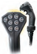
Pendant boom control with live hydraulic front fold models