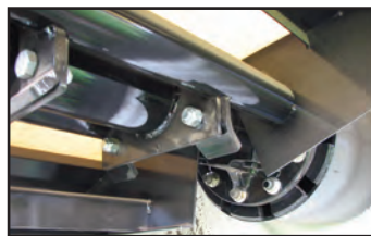
Easy attach tank mounts

NOTE: Not applicable on tractors with LSW tires