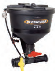
7 gallon chemical eductor and the 33 gallon foam marker are optional