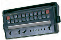
Raven® 450 sprayer control system

The hydraulic front fold booms feature a nitrogen charged accumulator system combined with leveling linkage and shock absorbers to soften the ride. Live hydraulic control block requires only one set of remote outlets to perform all boom functions.