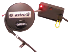
Astro II GPS Speed Sensor for use with Raven® 450