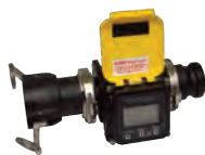
2" Flow Meter with digital display