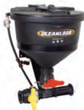
7 gallon chemical eductor and the 33 gallon foam marker are optional