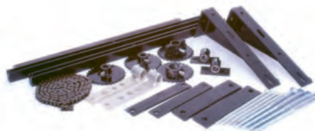
Pump Mounting Kit